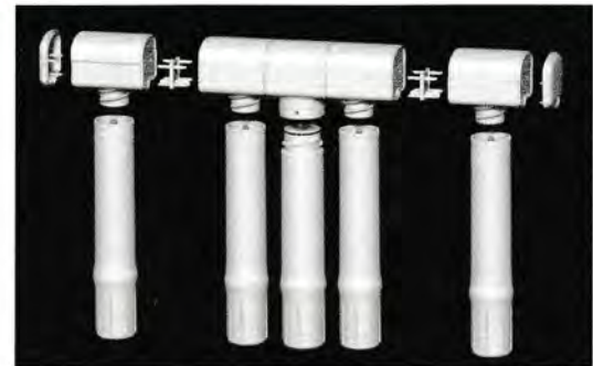
This drawing illustrates some of the customizable filter connection options the HERO 375 has to offer. Additional filter(s) may be added on to either side of standard unit.