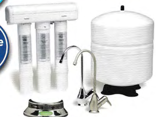
OPTIONAL Electronic Monitoring Faucet Base