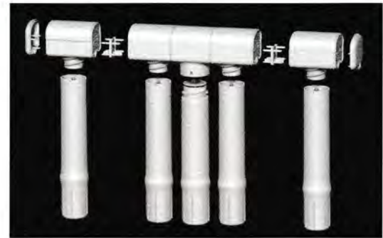
This drawing illustrates some of the customizable filter connection options the ERO 375 has to offer. Additional filter(s) may be added on to either side of standard unit.